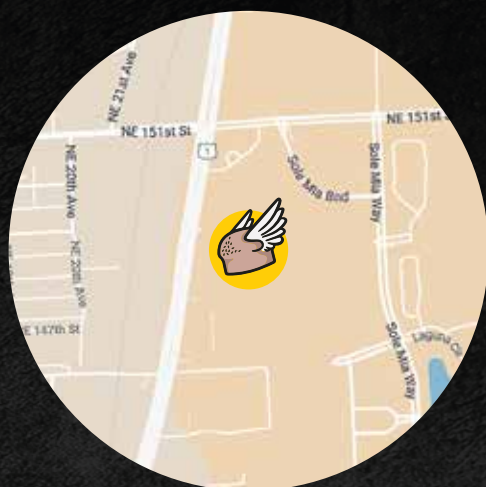
NORTH MIAMI BEACH 14831 Biscayne Blvd, North Miami Beach FL 33181