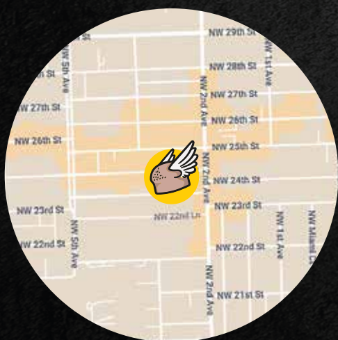
WYNWOOD 250 NW 24th St, Miami, FL 33127