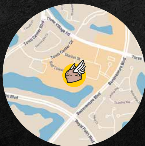
WESTON 1830 Main St, Weston, FL 33326